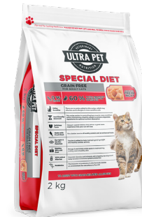
Grain Free V12492